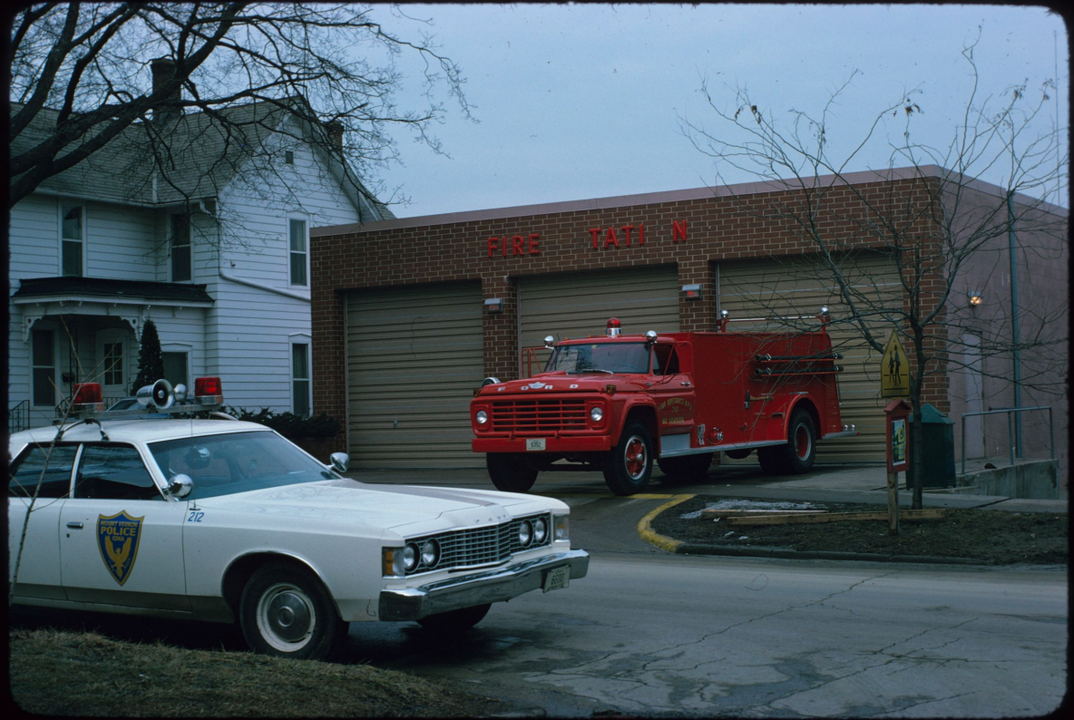
Left: The Previous Fire Station / City Hall. Right: The replacement Fire Station built in 1967.