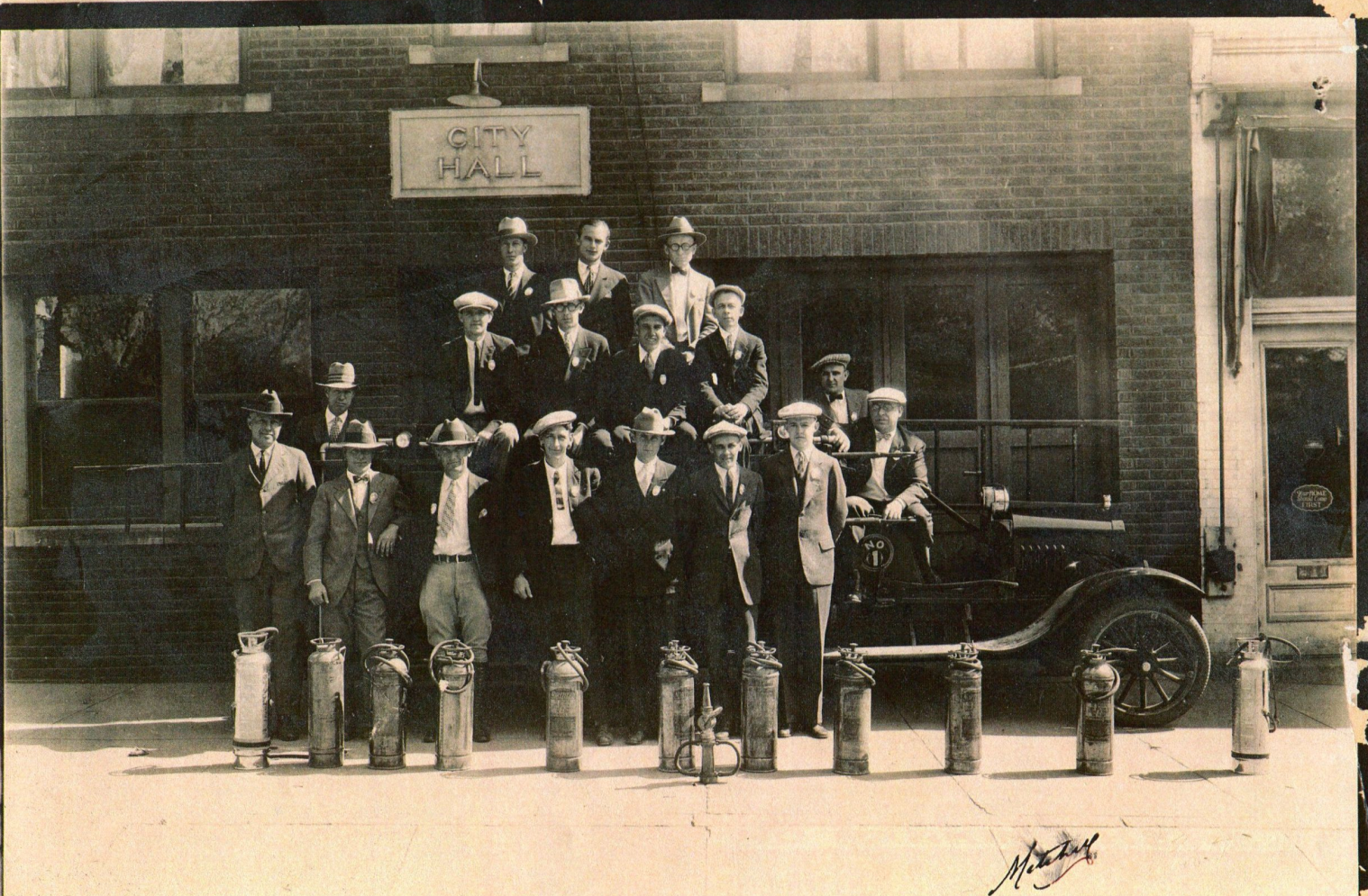
MVFD crew as of 1927.