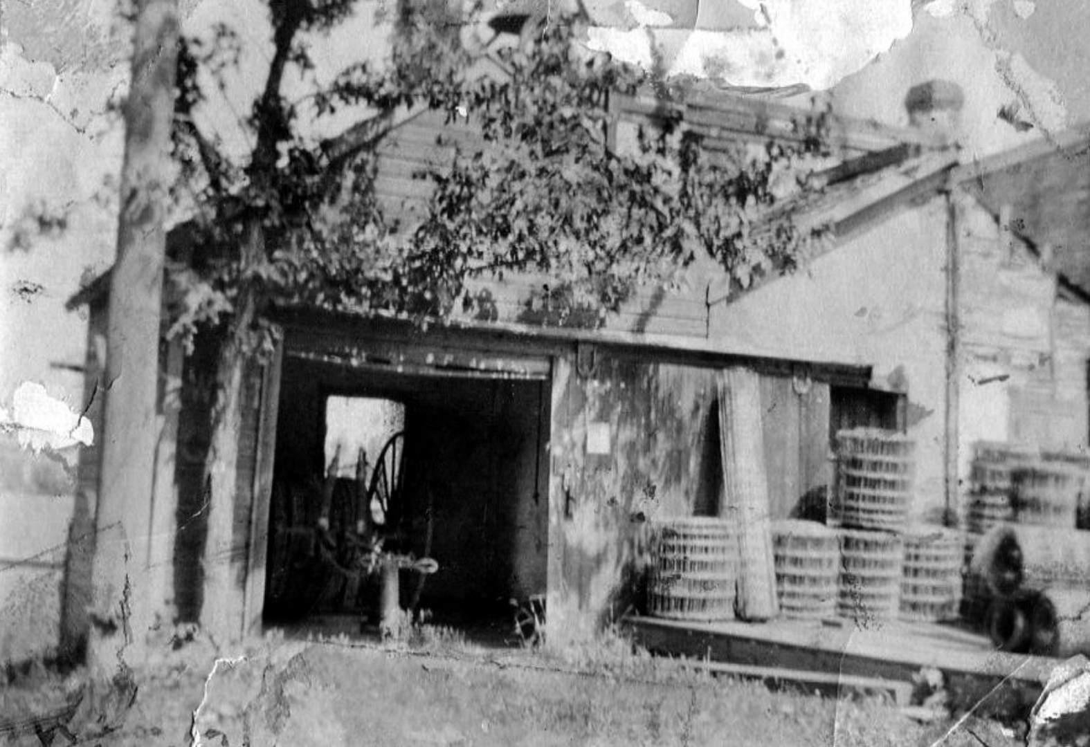
The Fire Station / City Hall as of 1916. Inside the garage is the Franklin township fire truck. A fire siren is located on top of the building, it was blown every day at noon.