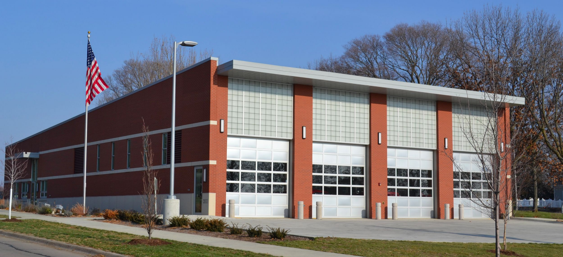
The new Fire Station.