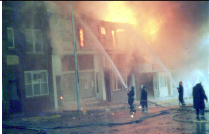
Bottom: Firefighters fighting the massive blaze.